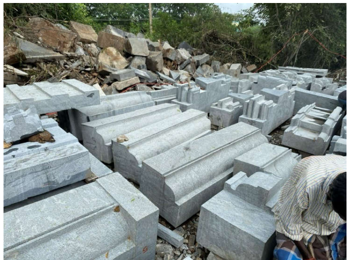
Rest of the Pictures – Craftsman doing the carving, chiseling and final touches at the workshop