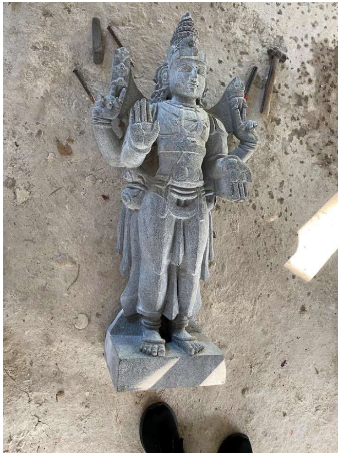
Above - Carving of a statue in progress for the Rajagopuram